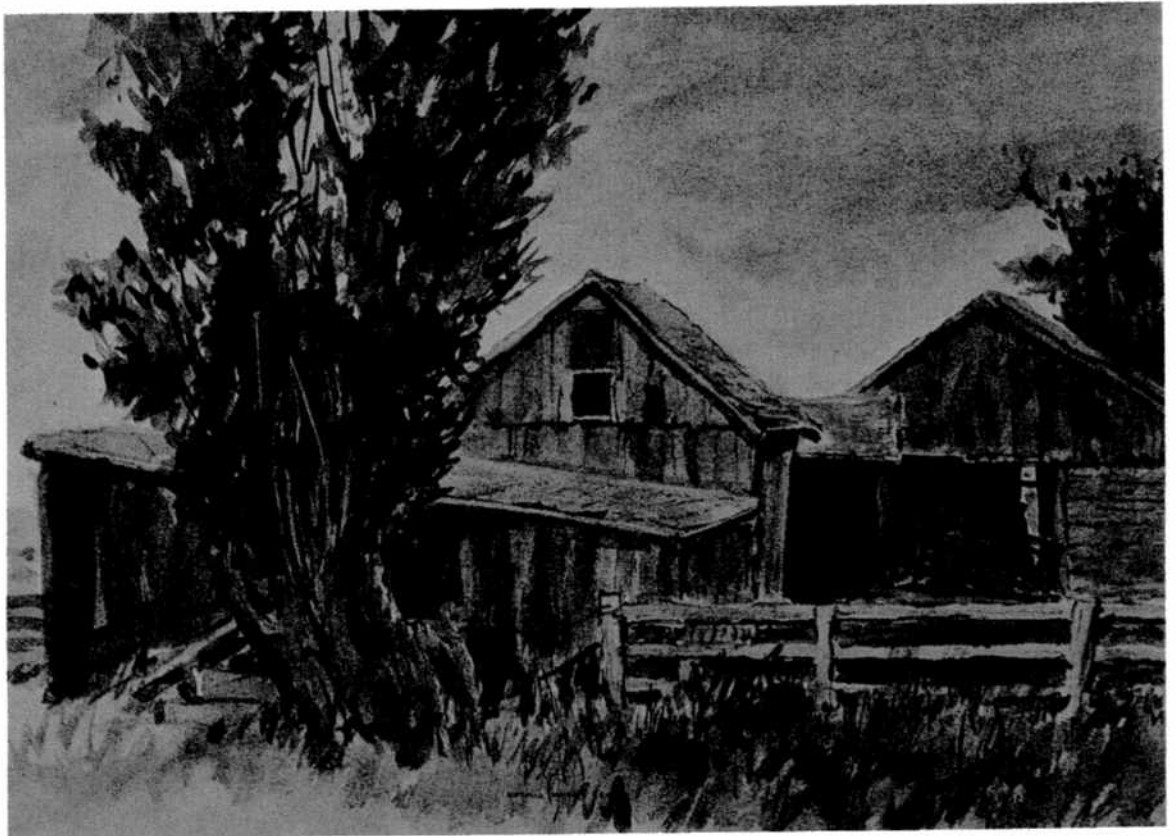
Deserted by Norman Matheis, watercolor 21 x 29 inches