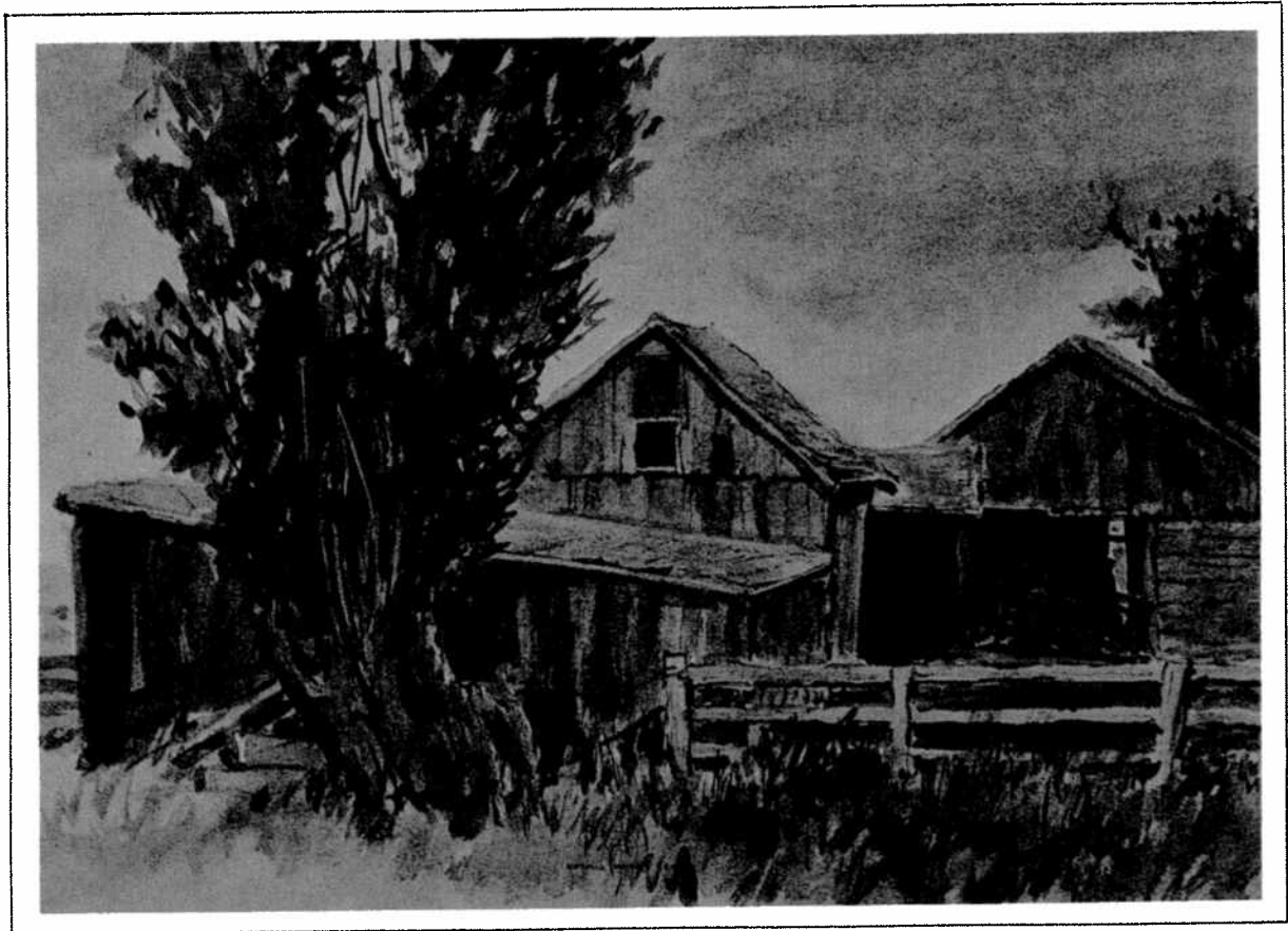
Deserted by Norman Matheis, watercolor 21 x 29 inches