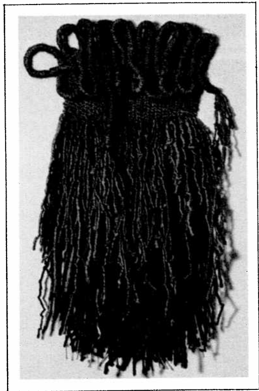
Blue Wrapped Rhythms 17 x 10 inches Both by Joanne Alberda