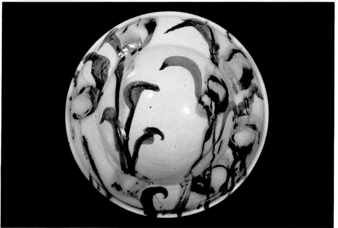
Deep Bowl Stoneware 12'' wide