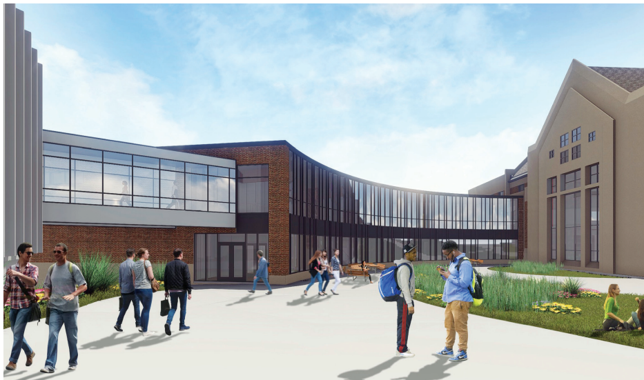
Pictured is the north side of the new Dining Commons, which will connect the Campus Center and the B.J. Haan Auditorium.