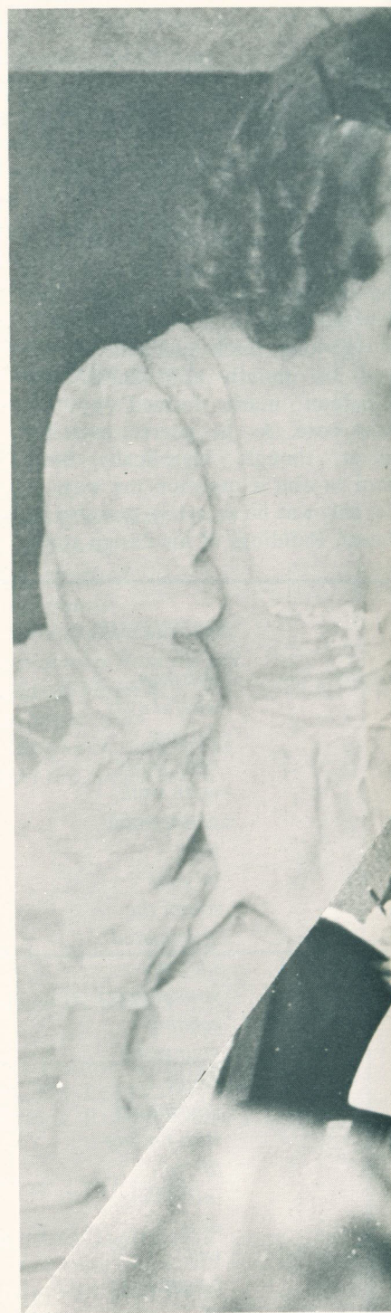
New World Theatre Consortium flirts and panel members