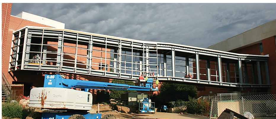
CARL FICTORIE ('90)