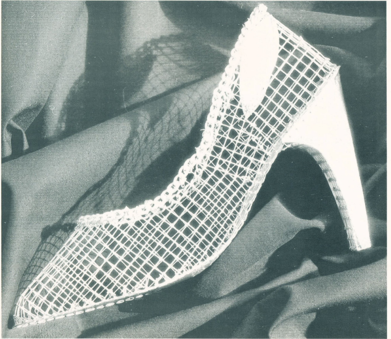
Walk in My Shoes