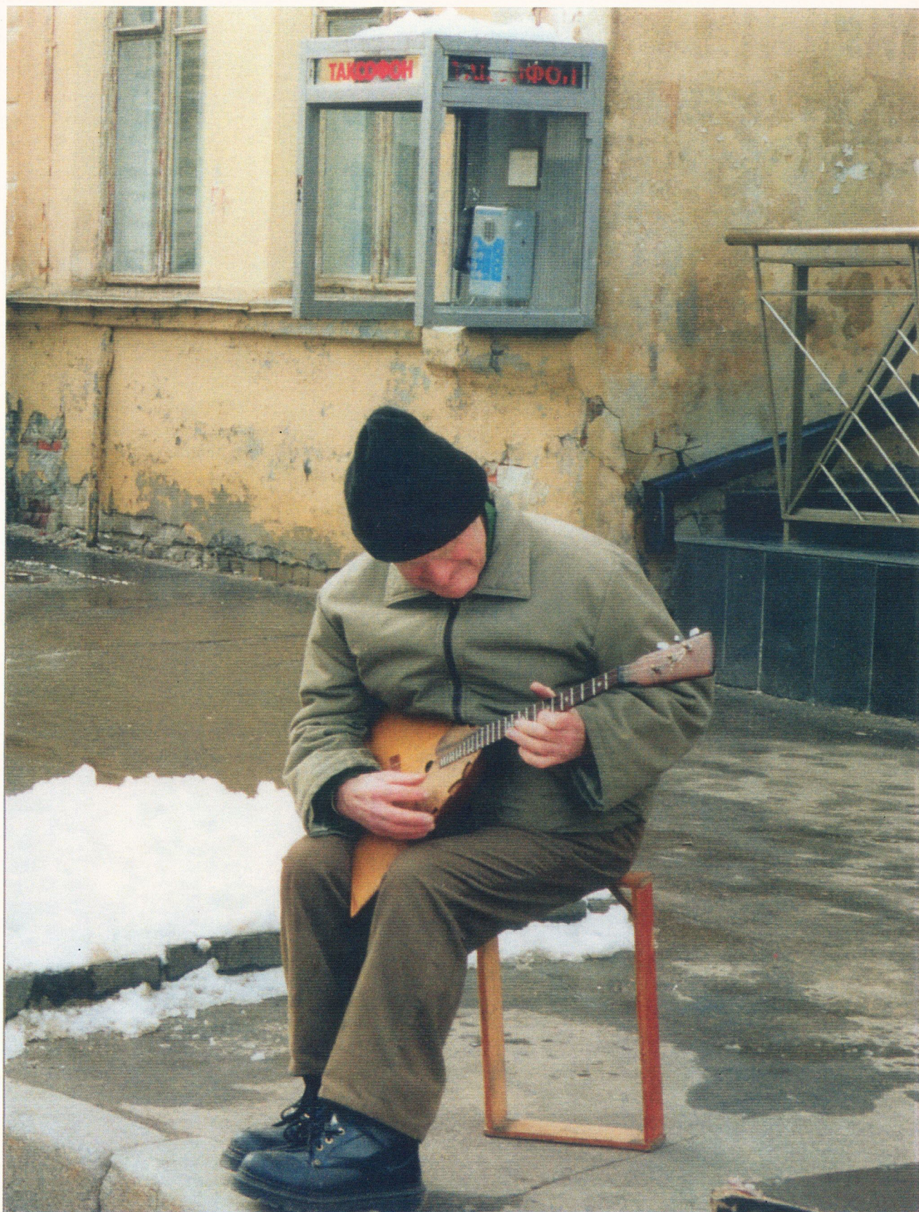
Balalaika Busker on Bolshoya Pokrovskaya