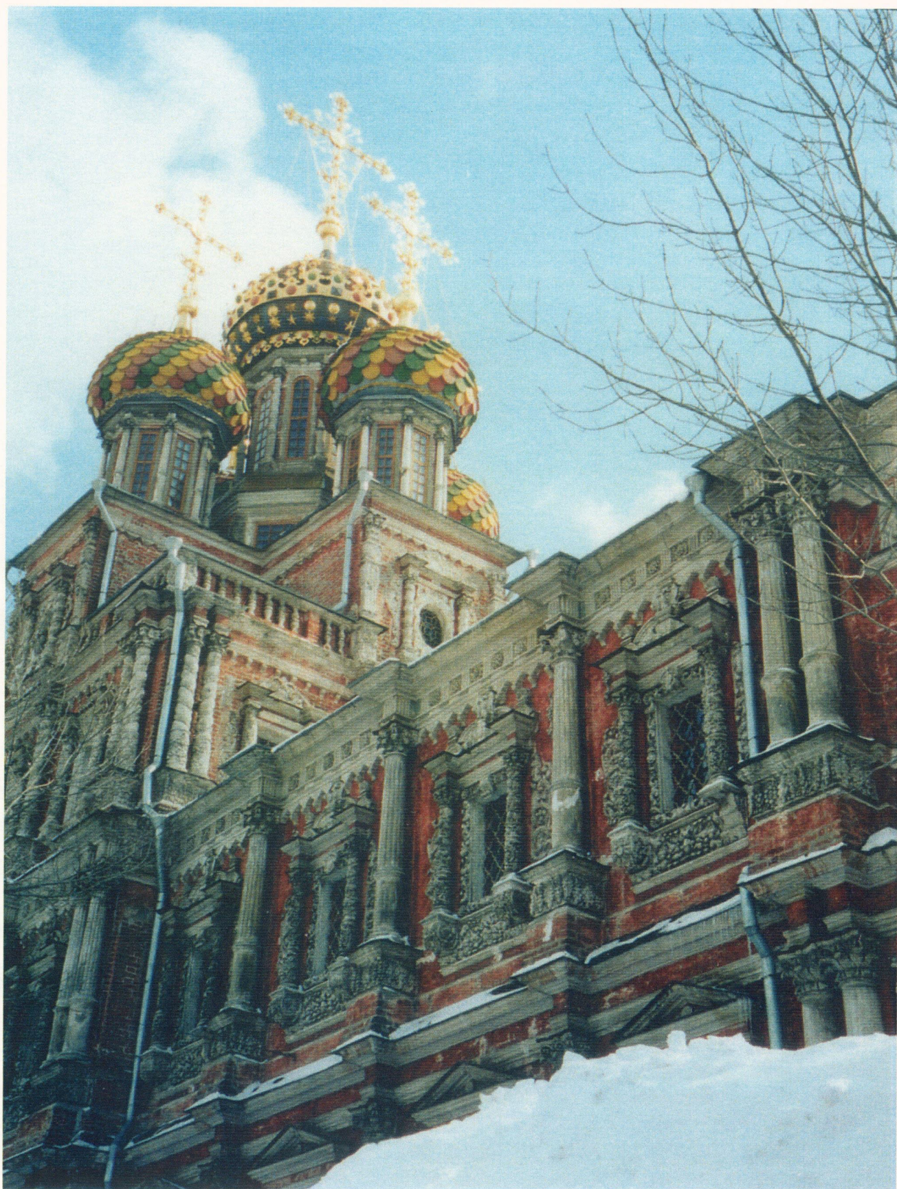
Tserkov Sobora Presvyatoi Bogaroditsii - Our Lady's Nativity Church