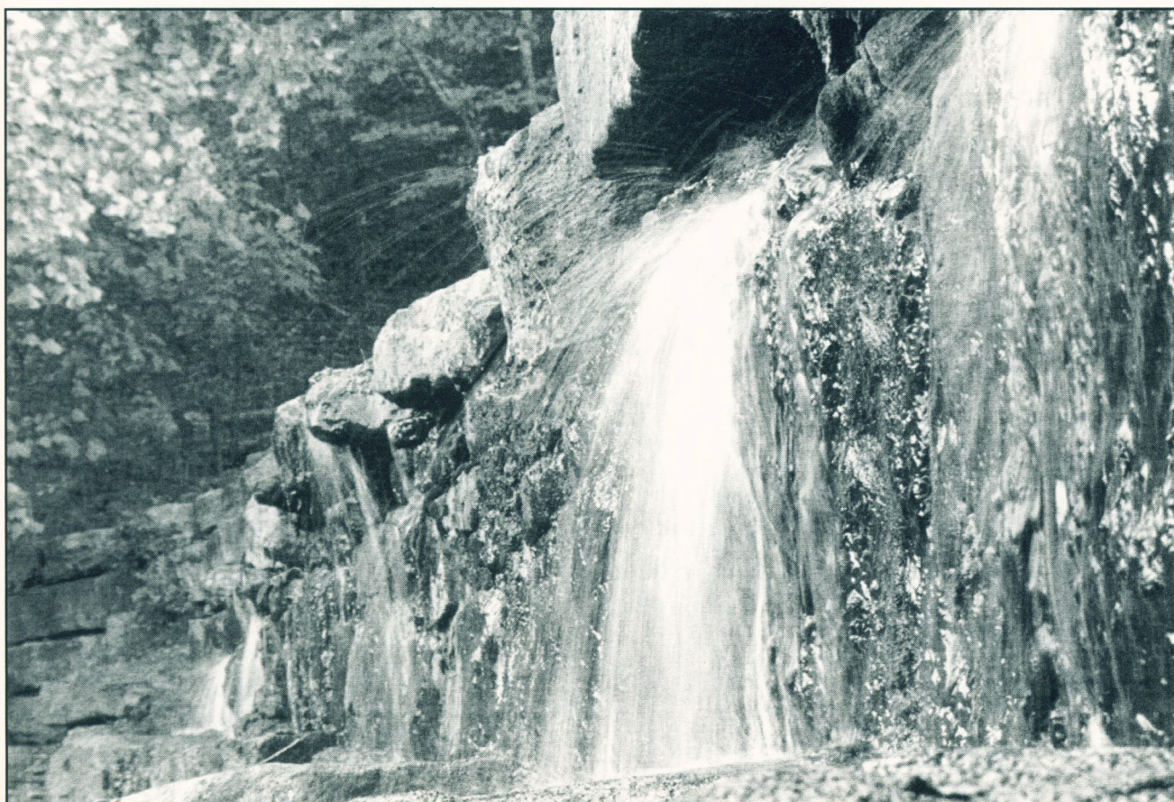
Constant, yet Changing